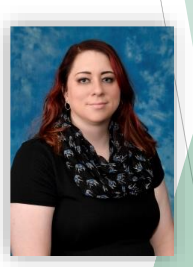
Administrative Support Associate