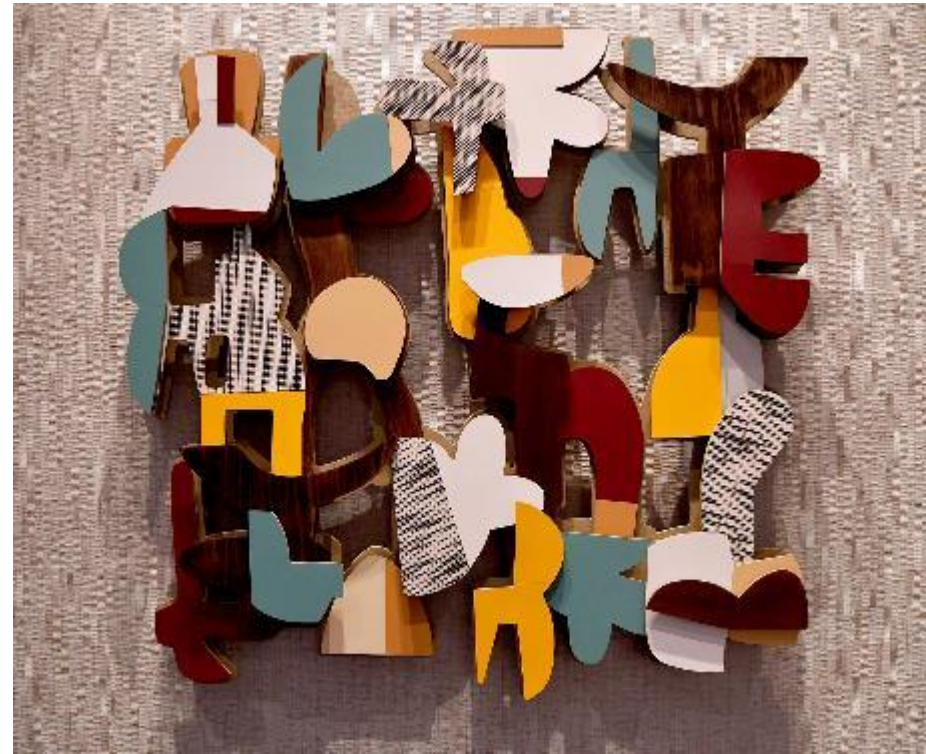
"Artwork in Marriott Hotel and Conference Center, Lobby 1" https://ucomm.charlotte.edu/media-asset-type/photos