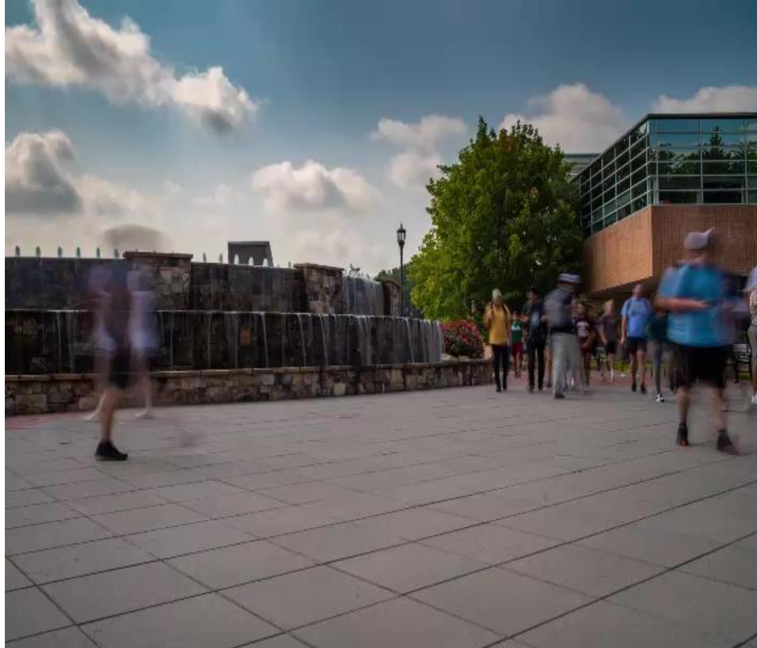
Charlotte Communications, "Belk Plaza Timelapse"